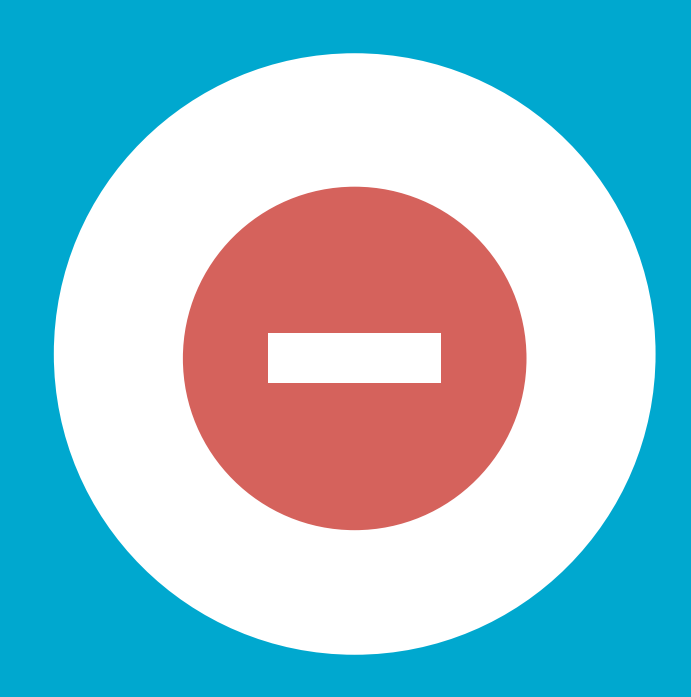
Refuse entry if an individual does not comply