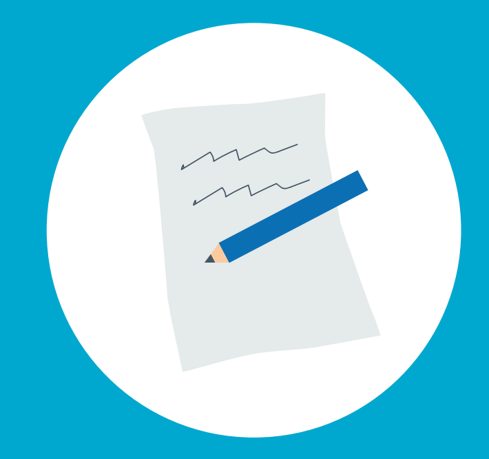
Or provide their contact details (name and contact number)