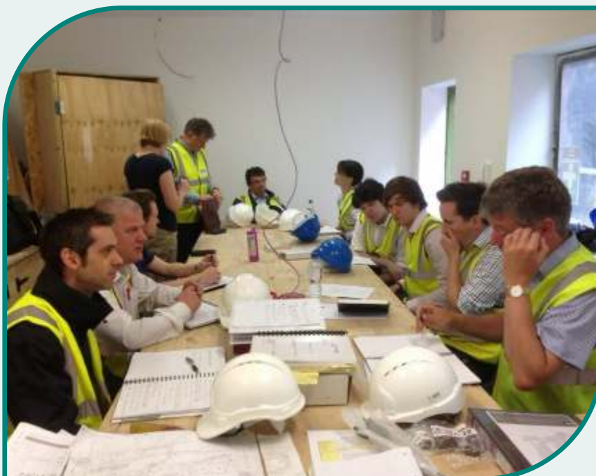
Site Team meeting, AIM Biffa Award funded project at the Coffin Works

In 1997 Biffa Group Ltd decided to donate landfill tax credits to RSWT to administer under the fund name Biffa Award. To date, Biffa Award has awarded grants totalling more than £156 million to thousands of worthwhile projects across the country.