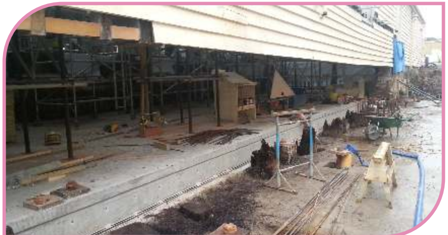
Crisis point! Contractor goes into administration leaving Scheduled Ancient Monument suspended in mid-air!

Having informed funders and stakeholders of the situation immediately, we also set a series of meetings up over the next 3 months to ensure that as our plans progressed we could get sign off rapidly, with our own Board as well as with funders.